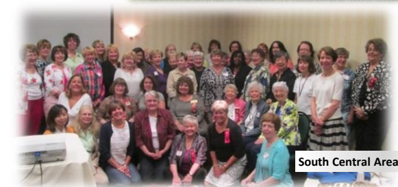
South Central Area Meeting