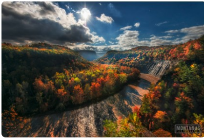
Letchworth State Park