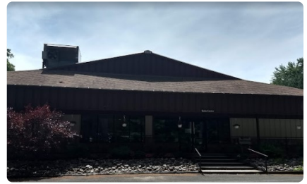
Delta Lake Bible Conference Center