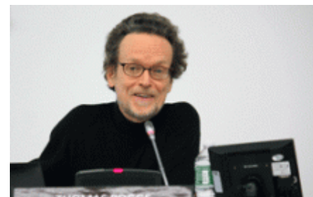
Thomas Pogge, Leitner Professor of Philosophy and International Affairs, Yale University, and Adjunct Professor of Law, Yale Law School, was keynote.