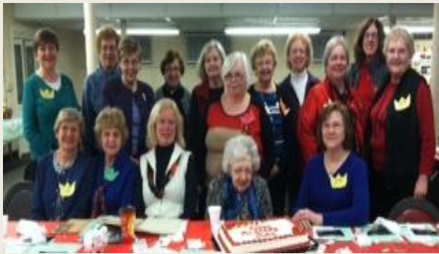
Beta Chapter, founded February 12, 1938, celebrates its 75 th Anniversary.