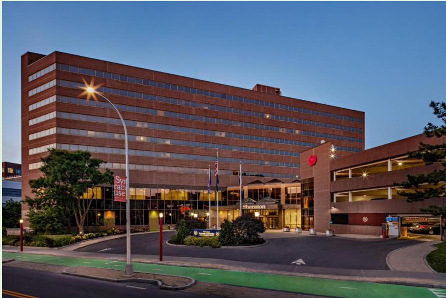
Sheraton University Hotel & Conference Center

April 29-30, 2022 Syracuse University Hotel & Conference Center 801 University Avenue, Syracuse, New York 13210