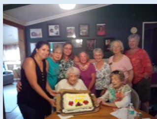
Congratulations Rho Chapter on your 70 th birthday!