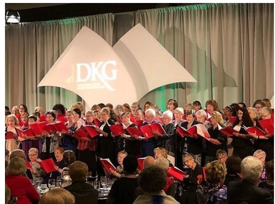
2018 Convention Choir