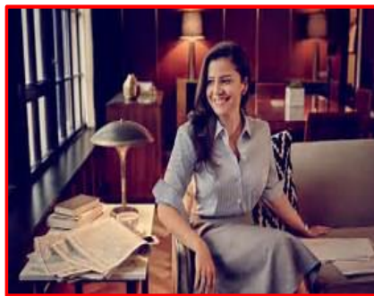
Congresswoman Elise Stefanik of the 21 st District New York