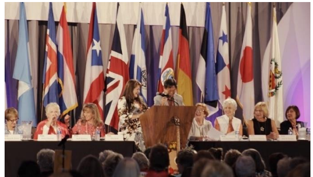
General Meeting, International Administrative Board