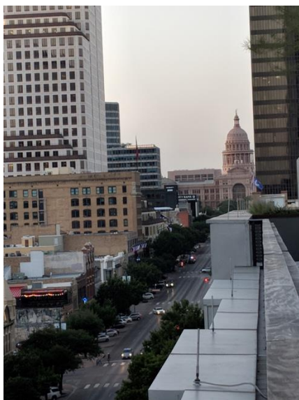
Downtown Austin in front of J.W.Marriott