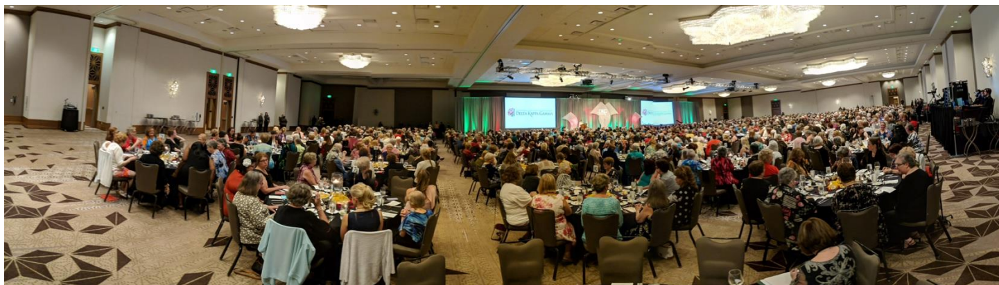
“Impacting Education Worldwide” Luncheon