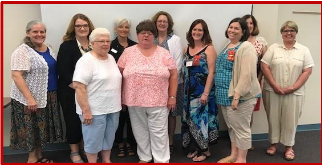
Participants in Baldwinsville LDS from Alpha Psi, Alpha Tau, Beta, Beta Chi, Beta Mu, Chi, Gamma Zeta, Nu, Sigma and Alpha Chi